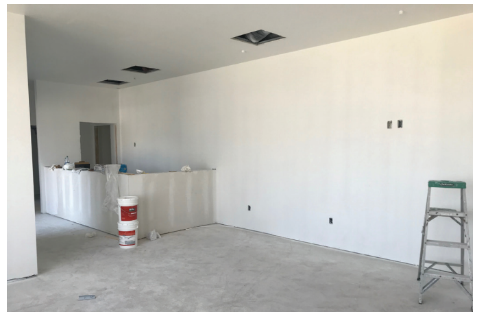
The lobby desk at InnerVisions South.