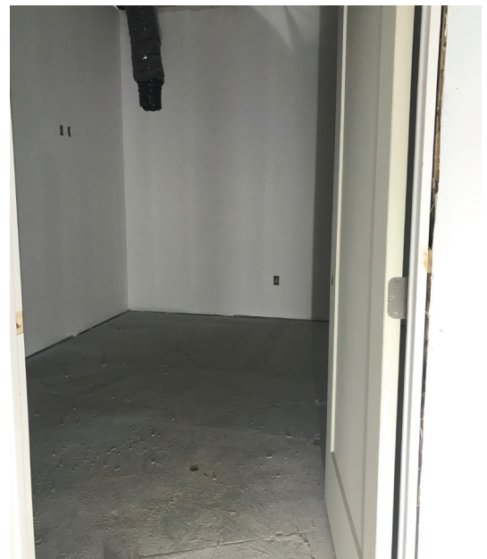
One of our new ultrasound rooms.

If you or your group is interested in a private tour of the clinic, even before it's completed, reach out to us today.