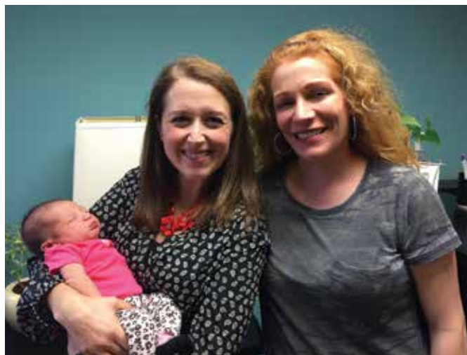
One of our moms benefits from this new partnership!

Talk about a win-win-win! Our donors receive a tax deduction for their in-kind gift! Once Upon a Child receives some great children's clothing! But, most importantly, our clients will be taken care of in a way that they feel empowered! Call the clinic for details or questions!