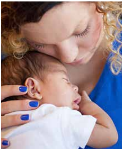
By providing for the needs of the mom, we're able to save two lives: mom and baby.